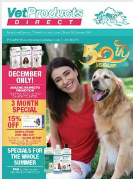
Vet Products Direct Summer catalogue