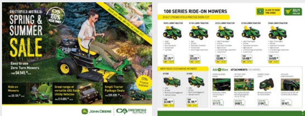
Chesterfield Australia 16pp retail catalogue